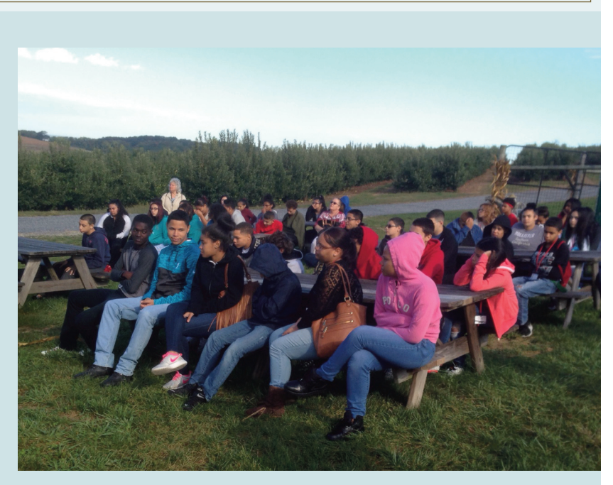
Reading Intermediate High School ninth graders learn about Pennsylvania horticulture at Ontelaunee Orchards in 2016.

The MRC video library may be accessed at: www.whatssocool.org