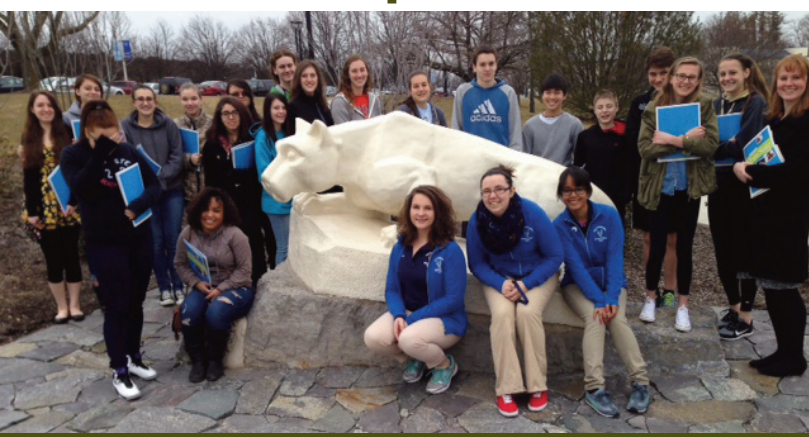
Wyomissing Area School District ninth graders visiting in 2015 with the Nittany Lion at Penn State Berks.

The schedule was set for the spring 2020. Unfortunately, only three of the 18 high schools were able to complete their visits before COVID-19 brought the program to an abrupt halt.